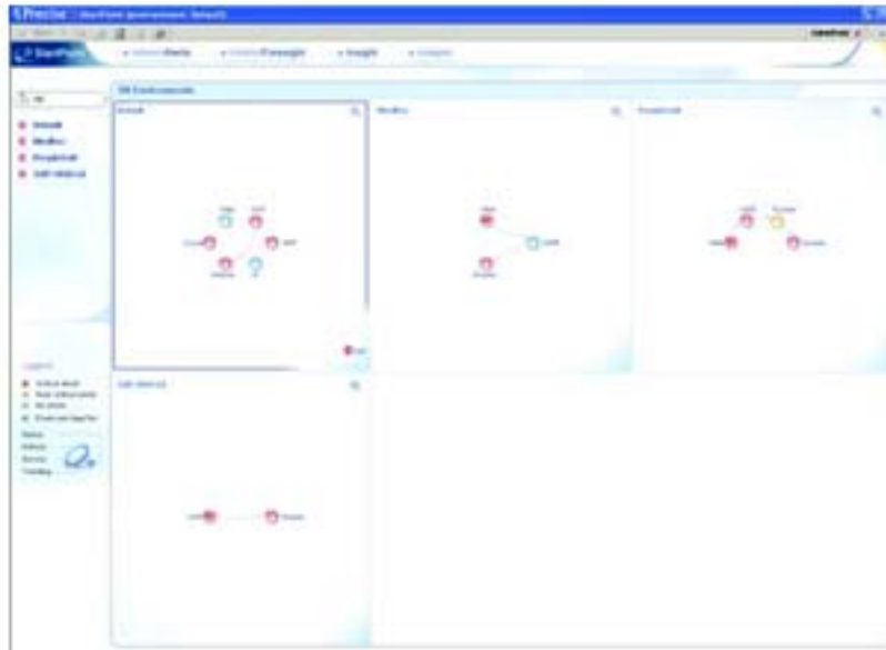
Precise UI showing an SAP Environment

Precise for SAP provides your IT or SAP Basis team a full end-to-end view of all applications tiers in the SAP environment and provides an alert overview of the various components by category, in a simplified way so as to facilitate communication by team members—for example, performance or load alerts at the database. From here, it is easy to find additional information when problems occur.