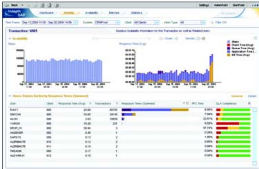
Precise correlates user transactions (VA01) with the infrastructure supporting them.

End-user satisfaction is extremely important: If end users are satisfied, application managers are satisfied. Precise for SAP provides a way to measure response times as experienced by end users and to define SLA thresholds on those metrics.